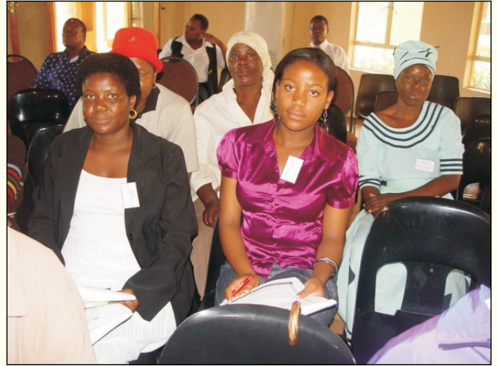
"We can see the promised land, the land of milk and honey!"

At the end of the seminar, participants from various walks of life thanked Limpopo Provincial Treasury for organizing such an informative and capacitative event.