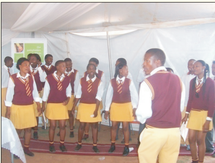
"We sing for the new tomorrow", Learners dishing out one of their sweet songs

"We just thought about looking back and seeing our own roots as a school. We want to strengthen our children's future, to guide them and assist them financially", said