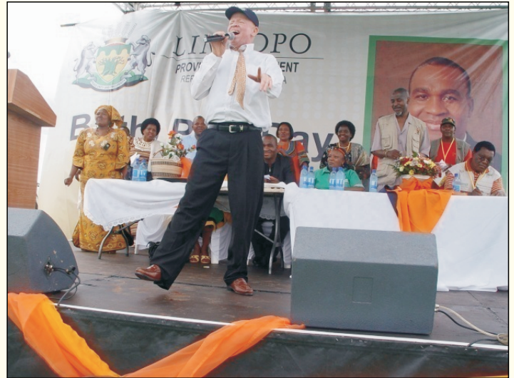
Lekgowa mania erupting throughout the stadium like summer thunders!