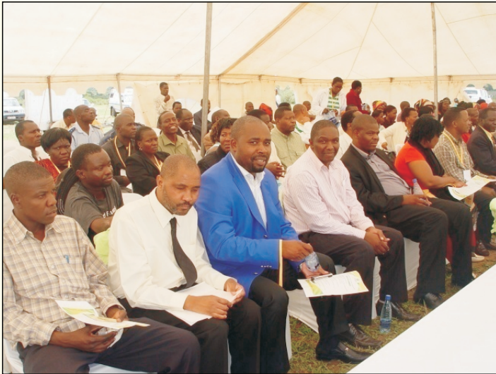
"We are delivering as Government", some of the Government officials who graced the occasion!