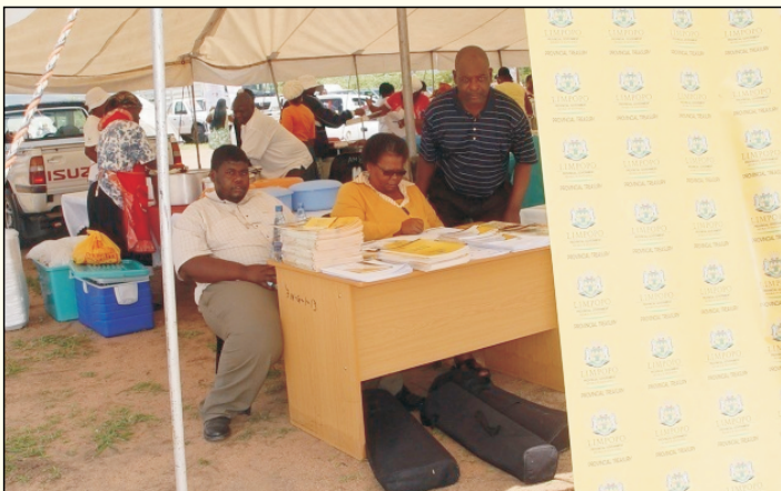
"The voice of Limpopo Treasury always echo far and near", Treasury employees from Mopani exhibiting at the occasion.

Through the Maruleng Thusong Service Centre, the community will get among others, IEC services, Municipal services, Youth development services, Provincial Treasury services, Social Development services, SASSA services, Home Affairs services, Police services as well as services from the Department of Agriculture.