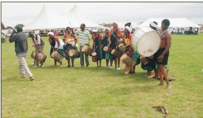
"Africa is my music"