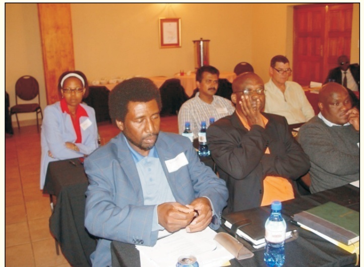
"Forward we march and we will succeed".