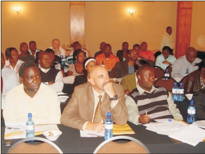
"Hhhhh! We now see light at the end of the tunnel"

The purpose of the workshop was to build more capacity in all Government institutions on issues of Risk Management. It was also an effort to conscientise Government institutions about the importance of Risk Management units and the implementation of policies that are in place.