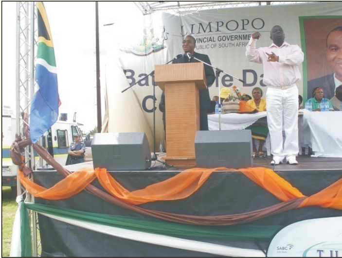
Noble words from the Premier, Mr Sello Moloto!

Under the theme “All hands on deck to speed up change”, and in the spirit of Batho Pele, about one thousand and three-hundred people gathered in the Mookgopong local municipality in the Waterberg region to celebrate the annual Batho Pele day. The colourful event took place at the Mookgopong stadium on the 25 October 2008.