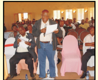
Supply Chain Management Seminar ...P12

IPOPENG HIGH SCHOOL'S 59TH YEAR ANNIVERSARY CELEBRATION ...page 5