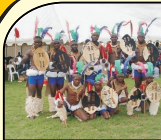
Batho Pele Day Celebrations... P2