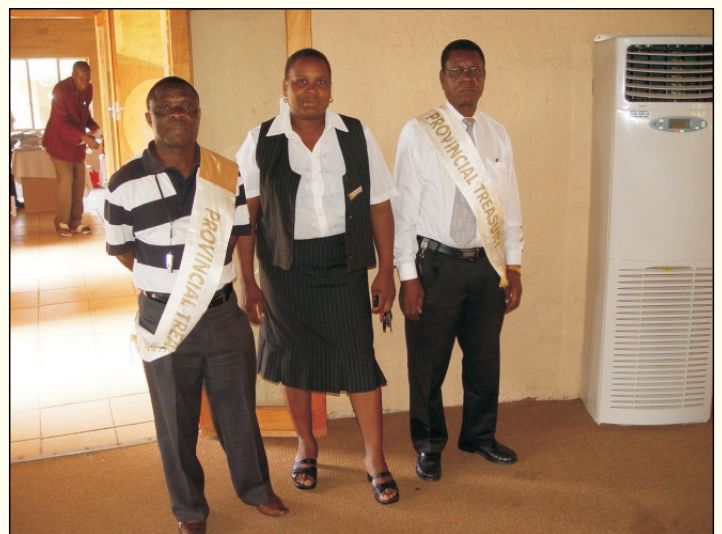
"We are the foot soldiers at the coalface of change", Treasury employees in a serious service delivery mood

"Participate in these tendering activities so that money can circulate within this local municipality.