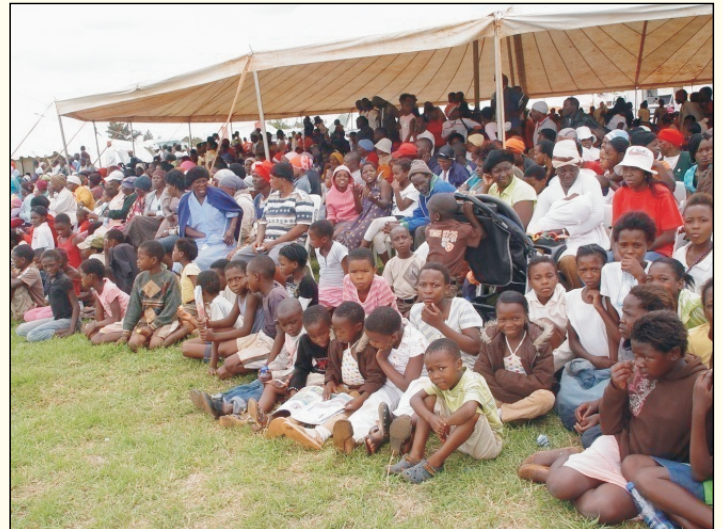
"We support our government"

The purpose of holding Batho Pele day celebration is for Government to present the citizen s' report.