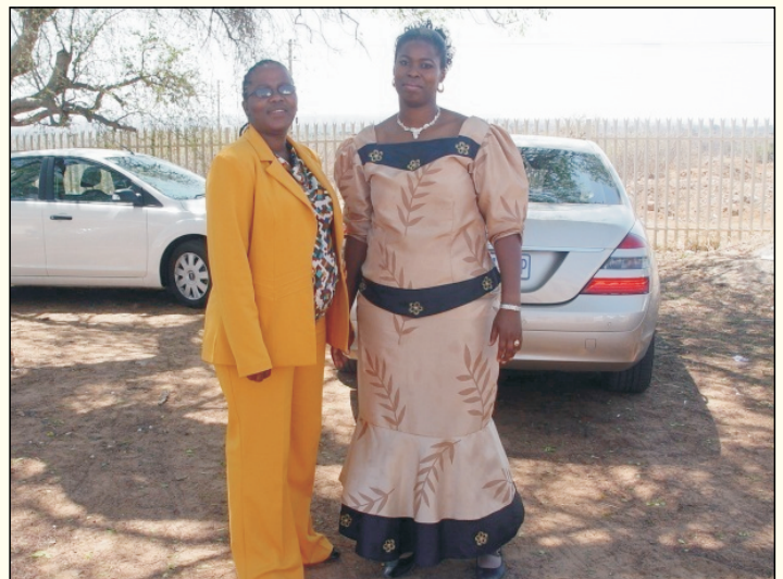
"Flowers of Africa, beauty too rich for use and for earth too dear!"

At the end of the programme, all the former students of the Ipopeng High School made individual pledges on how they will contribute to the upliftment of the institution.