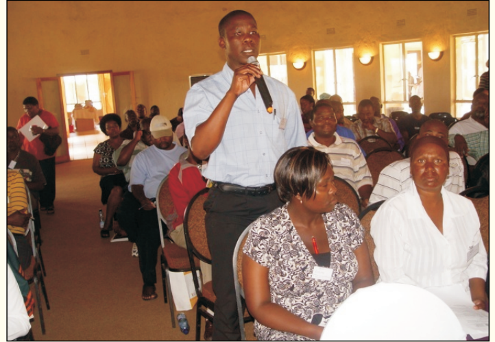
A member of the public giving voice to his thoughts