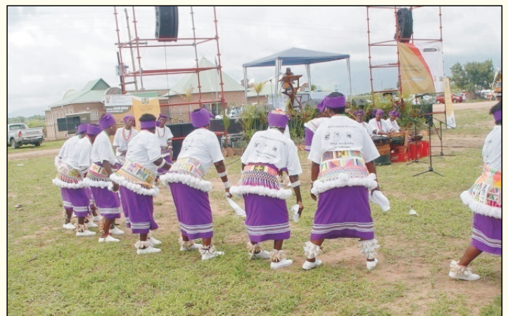
"We are like colours in a flower garden, shimmering in white, purple and yellow".