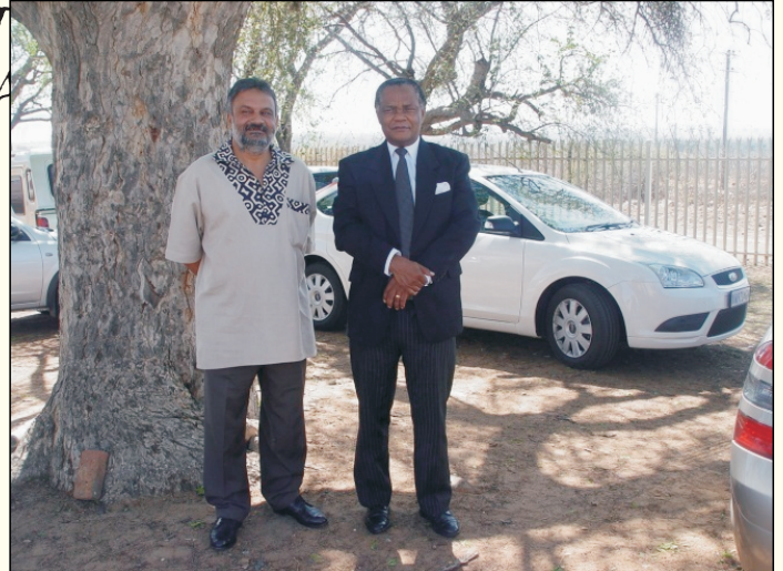
"Iconic leaders, men of the people looking into the future, the new dawn"

He applauded the existence of Ipopeng Progressive Convention, a body that is made up of the former products of the school. Its duty is to plough back into the