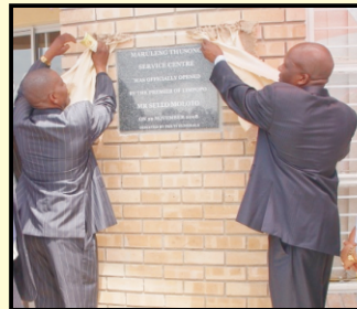
Launch of Maruleng Thusong... P10